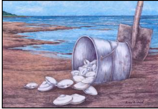
Clams, symbol of Eastern Canada resistance