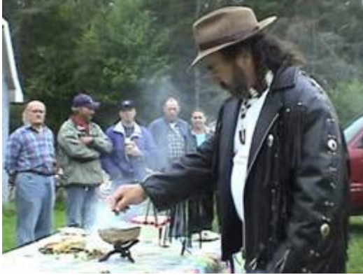
20th August 2006 in Kouchibouguac (New Brunswick)